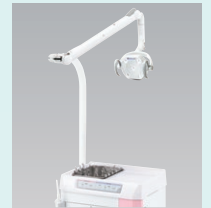
When mounted on the unit

The range of light angle adjustment is wider than that of our conventional products. This mechanism enables lighting from various angles.